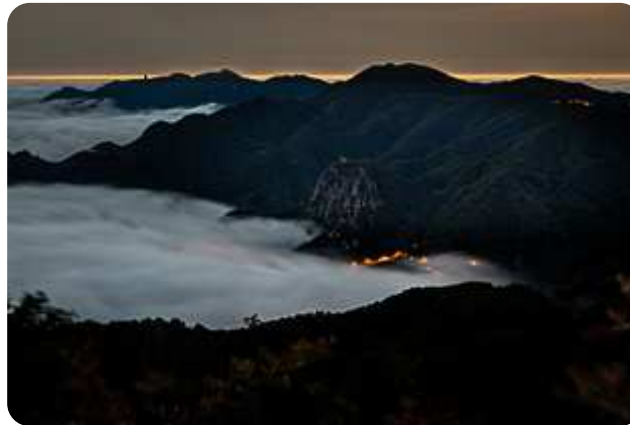
sunrise in the Anaga mountains