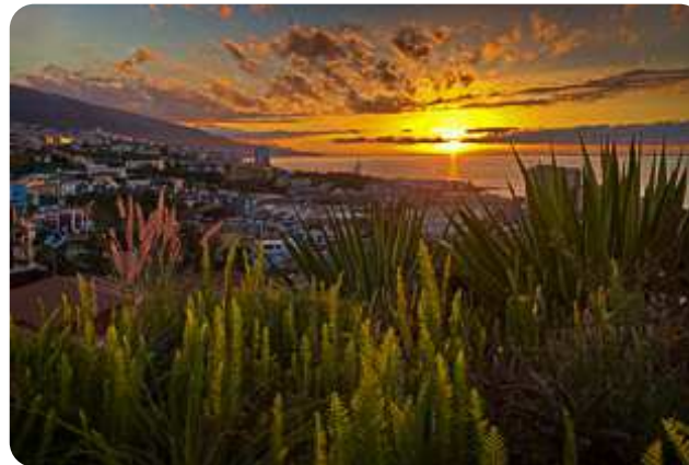
sunset at Puerto de la Cruz

walking all the way to the city center today, I already looked around for dinner options at home. We decide to go to Alberto's bar, which should have a good Sangria and pizza. Well the Sangria was really good (and strong), but forget the Pizza - one from the fridge tastes better.