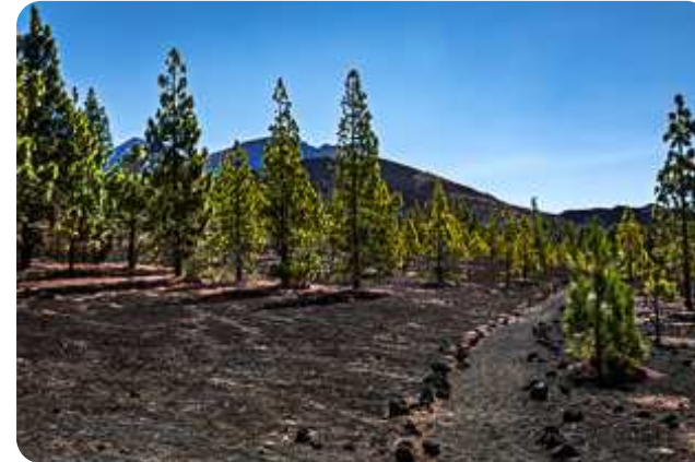
near Mirador de Samara - Teide NP

We stop at one of the viewpoints and take some pictures before the sun is too low. Even we know that it's useless I continue till El Portillo, but shortly after I give up and turn around to drive back to the hotel.