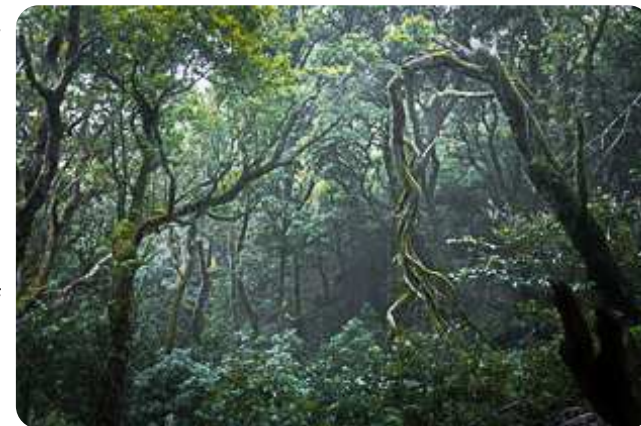
near Cruz del Carmen

Right across the visitor center is the trailhead for 3 hiking trails. No. 1 is short and easy and should be doable for most handicapped people, as long as they are able to manage a few meter height difference.