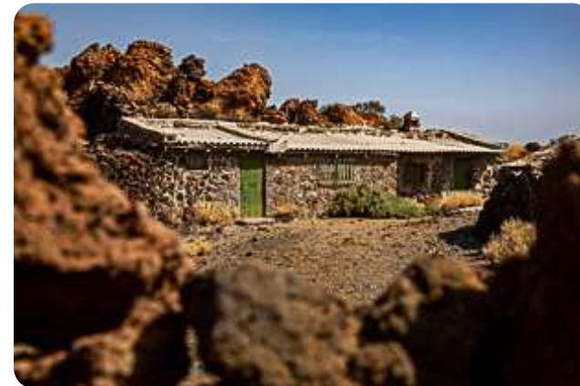
former sanatorium – Teide NP

if it's closed here, it might be closed there too.