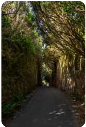
Camino viejo al Pico del Inglés

After breakfast, we leave the hotel and drive towards Cruz del Carmen. After a while, I wonder how the car is able to