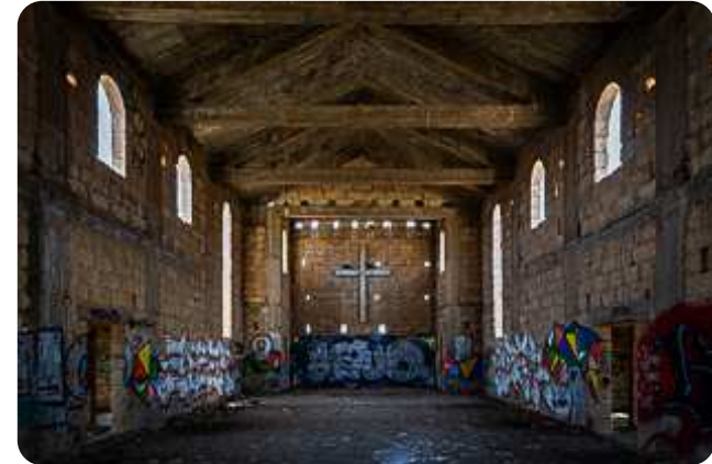
Sanatorio de Abona

plore. Almost all are covered with graffiti, some really good ones, many are just