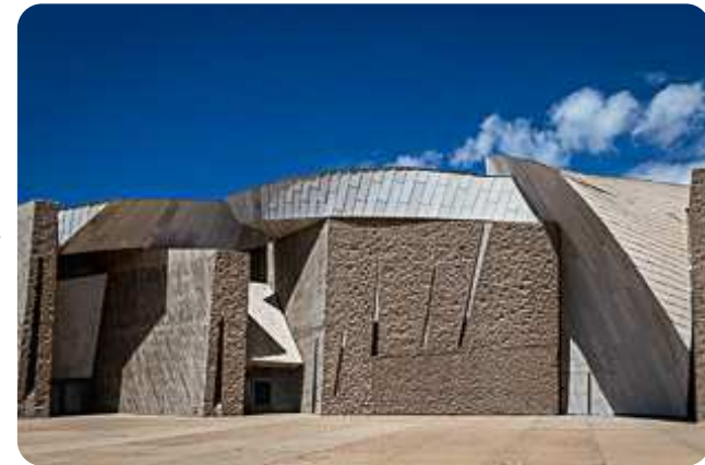
Magma Art and Congress Center – Adeje