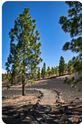
near Mirador de Samara - Teide NP

For dinner, we drive down to town, as we want to go to our favorite restaurant, La Tasquita de Berna, and have another good fish of the day. Regrettably, we have to stick to water as I have to drive (climbing stairs is still not a good idea for Freya), but back at the hotel, we share a bottle of wine.