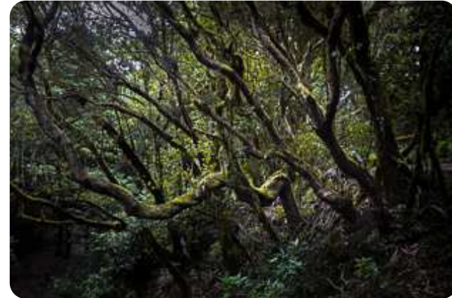
near Cruz del Carmen

Weather is changing fast here and when we finished eating, the clouds are gone and we can see patches of blue sky above us.