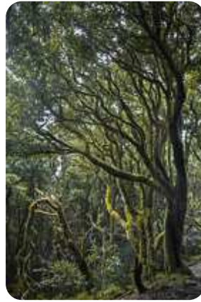
near Cruz del Carmen