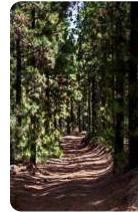
near Casa del Caminero