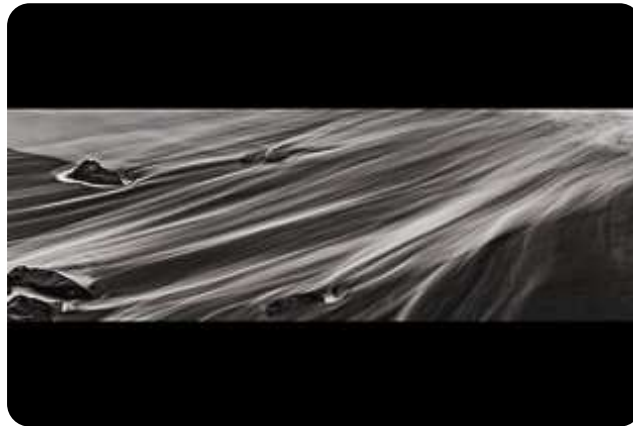
Playa El Bollullo - Puerto de la Cruz

Our flight doesn't leave until after 5 pm, and hotel pickup is scheduled for 1:15 pm. So plenty of time to kill, but not enough for anything serious. After breakfast, Freya goes for a swim in the