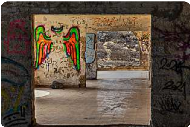
Sanatorio de Abona