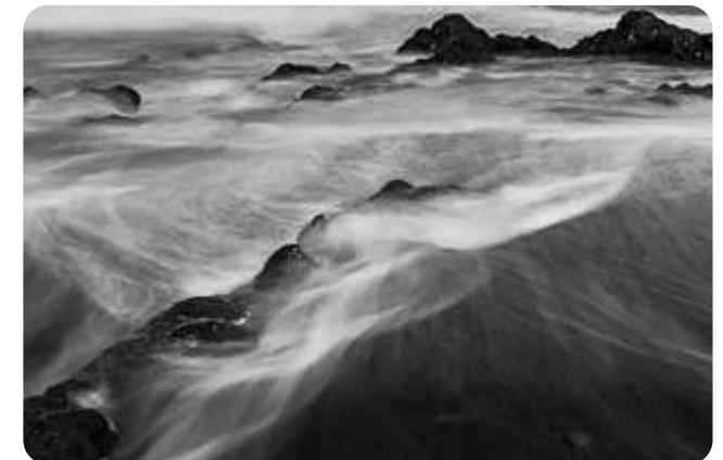
Playa del Castillo - Puerto de la Cruz