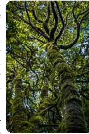
near Cruz del Carmen

she crawled out of bed so early this morning.