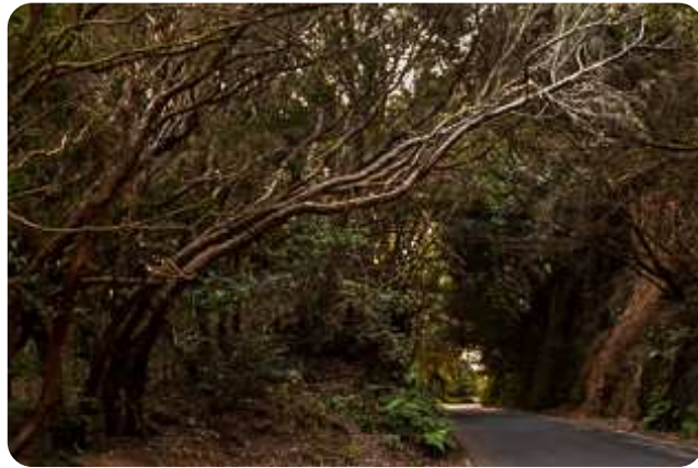
in the Anaga mountains

The hike to Pasada del Fraile is another one I found on berge-wandern.de . It starts at Casa del Caminero, a bus stop at the TF-21. Right behind the building is a huge picnic area called "Area Recreativa Ramon el Caminero". They even have two barbeque areas there, but they are closed at the moment. If this is because of Covid or to prevent wildfire I don't know.