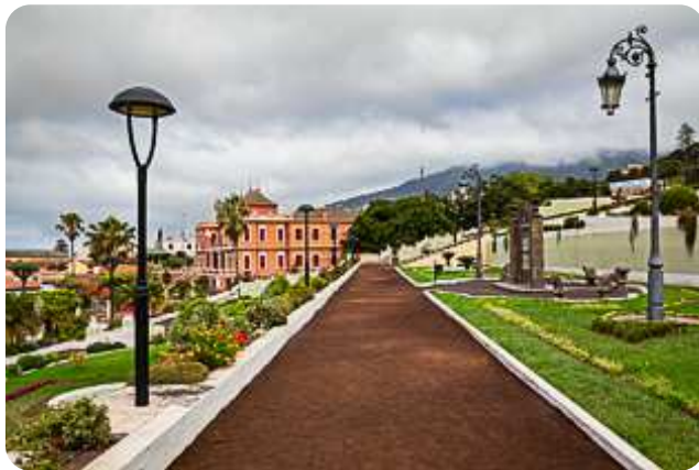
Jardines del Marquesado de la Quinta Roja - La Orotava

The trail is a loop trail that goes uphill at first and then steeply down to another forest road that brings you back to the starting point. Unfortunately, I did not pay attention to the information in the description, which says that I have to leave the forest road at a certain point. So I keep walking uphill until I realize that the path no longer matches the map. Well, at least I don't have to go uphill to get back to the place where I have to leave the road. It's right on a curve and I even saw it as I was walking by. At the time, though, I thought it was just