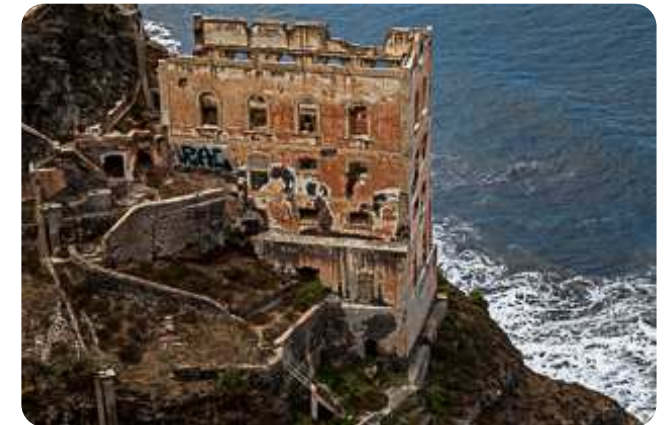
Casa Hamilton - Los Realejos

ready walked on Sunday, but this time I don't turn around early but finish the track. Is it me or are the most interesting trees near to the trailhead? The further I