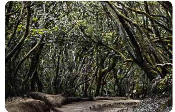
near Cruz del Carmen

the other side of the island, so I leave the hotel at 6 am.