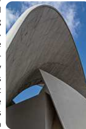
Auditorio de Tenerife - Santa Cruz