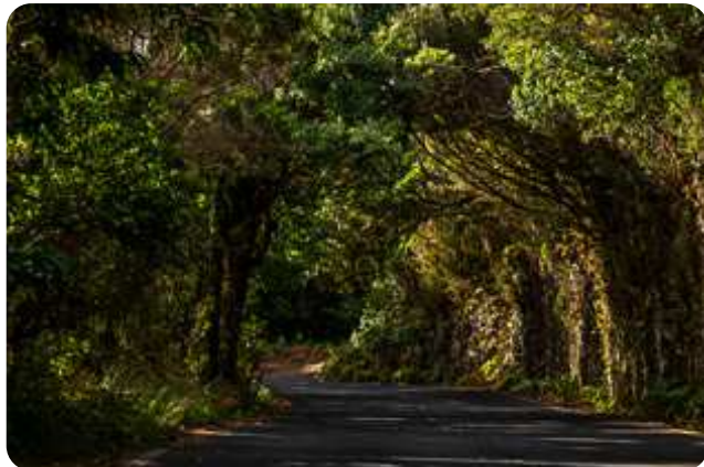
in the Anaga mountains