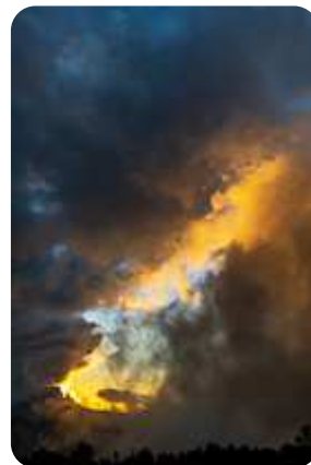
sunset in Teide NP