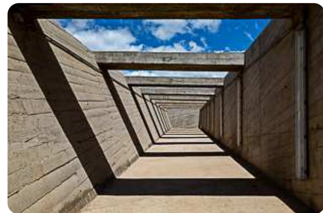
Magma Art and Congress Center – Adeje