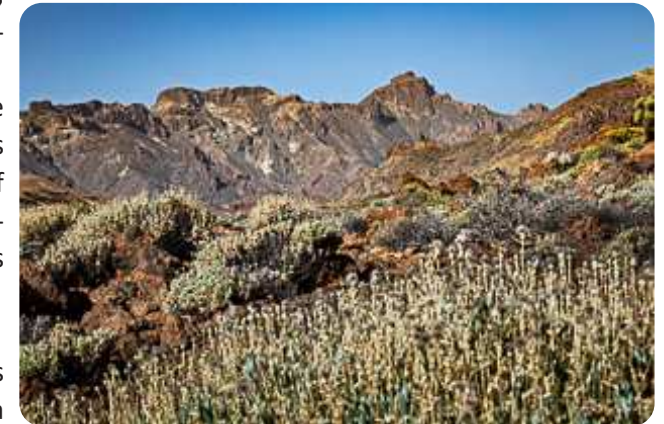
Canada Blanca - Teide NP

The trail starts a few meters behind that