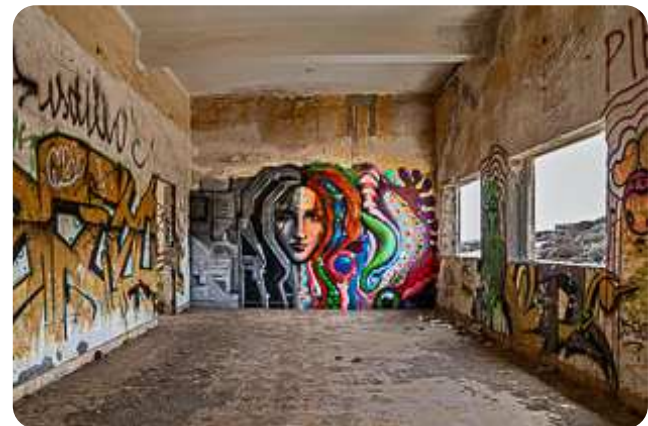
Sanatorio de Abona