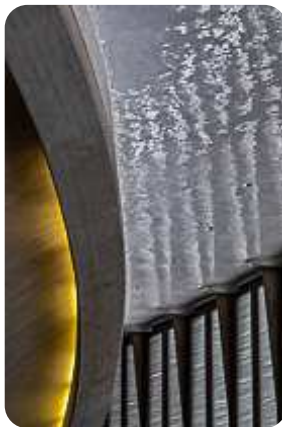
Auditorio de Tenerife - Santa Cruz

we don't expect many stairs in Santa Cruz, she comes with me. We take our time and leave only around 9 am. The drive to Santa Cruz takes a little more than half an hour and at this time there are no traffic jams