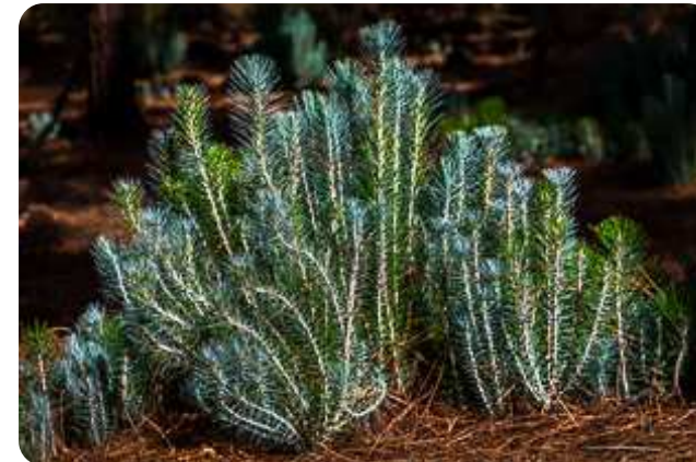
near Casa del Caminero

I passed this place a couple of times now and never saw a single car parking here. But today it's Sunday and the local families come together for a picnic. Right after me, 8 more cars are coming. People are opening the trunks