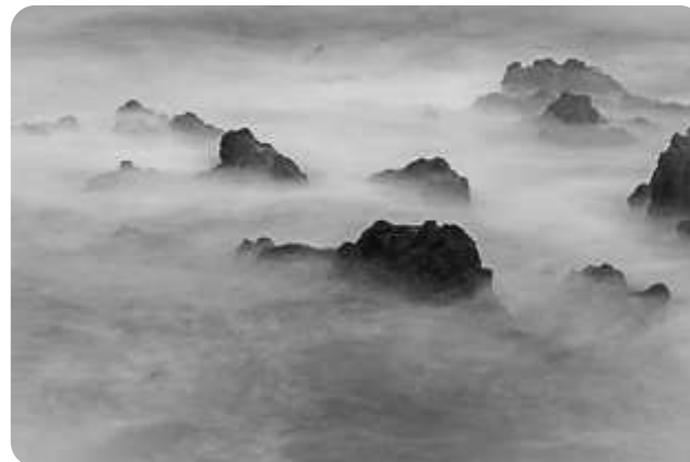
Explanada del Muelle - Puerto de la Cruz