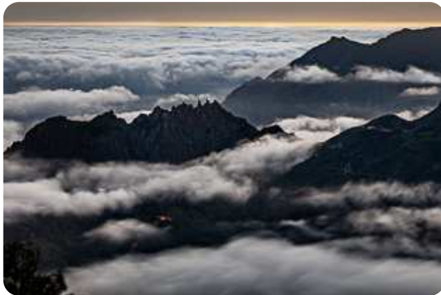
sunrise in the Anaga mountains

We stay at the hotel over lunch and later drive down to Puerto de la Cruz for a walk and an early dinner. We leave the car at the large Explanada del Muelle parking lot right by the sea and walk along the coast to Lago Martiánez. This is a huge artificial pool complex built in the 70s by Canarian artist César Manrique. It looks kind of nice and if you are here with kids, this might be something for