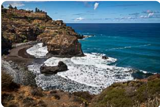
Playa de los Roques - Puerto de la Cruz