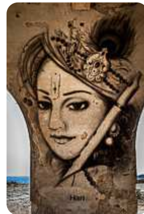
Sanatorio de Abona

right next to the highway, but now I don't want to. Halfway north is the small town of Abades.