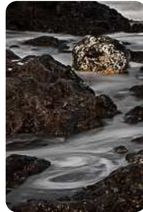
Playa del Castillo - Puerto de la Cruz

to be very nice for what I have in mind. They are black lava beaches with plenty of room for those who want to sunbathe. On two of the three beaches, the waves are too strong for most people to enter the water. Red flags are up on all three beaches today. Only a few surfers are in the water trying to ride the incoming waves. But even for them, this beach is not ideal. The waves don't break until they're close to shore, and more than once a surfer has just missed a rock as he lost the battle against the waves. For me, however, the rocks near the shore and the waves lapping over them are exactly the conditions I was looking for.