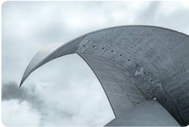
Auditorio de Tenerife - Santa Cruz

Finally, we made it and head for the old