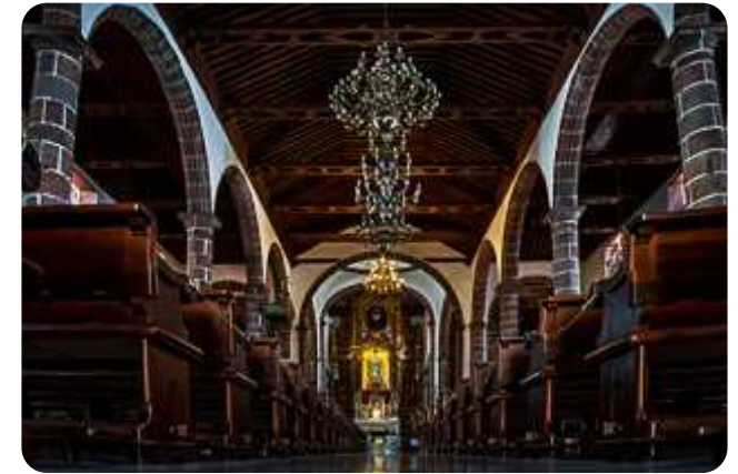
Nuestra Señora de la Concepcion - Santa Cruz

we don't expect many stairs in Santa Cruz, she comes with me. We take our time and leave only around 9 am. The drive to Santa Cruz takes a little more than half an hour and at this time there are no traffic jams