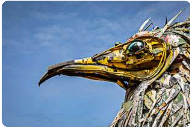
in Los Silos

right next to the skeleton, but access is blocked. Seeing how hard the waves are rolling in, I'm sure it has nothing to do with Covid, but that it's just not safe to go in the water.