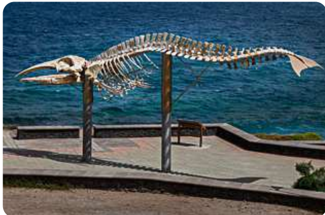
in Los Silos

Nearby is also El Bufadero, a blowhole. Freya stays with the skeleton while I go to see if it's even interesting. The answer is no - at least not with the kind of waves we have today.