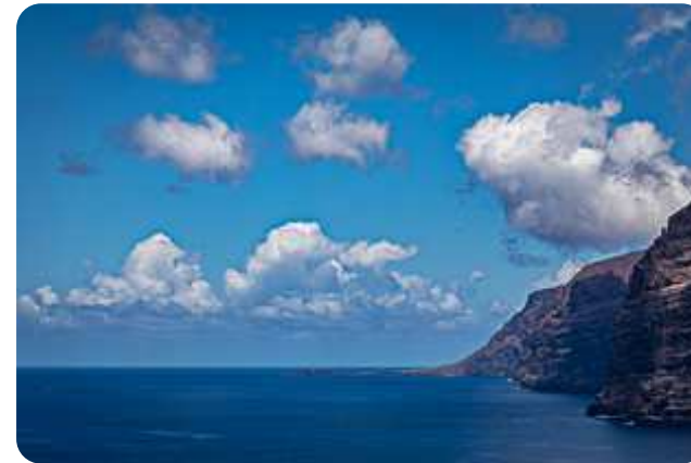
Los Gigantes - Santiago del Teide

of the night on the final part of our journey back home.