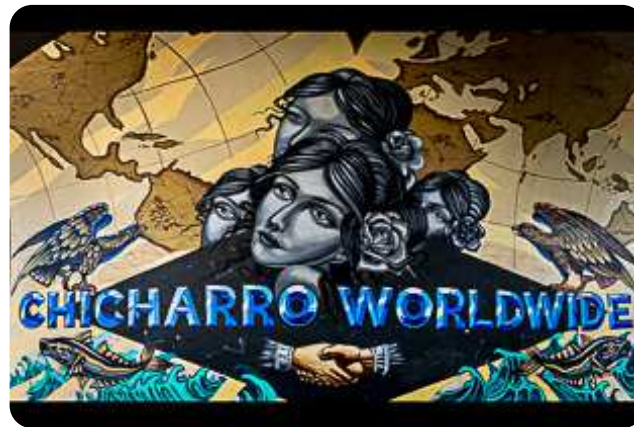
in Santa Cruz

cated directly on the Atlantic Ocean and is one of the architectural highlights of the Canary Islands. It only takes us about 10 minutes to get there. There is also a large parking lot