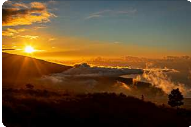
sunset in Teide NP

I didn't sleep well this night and think it's time for a relaxing day at the hotel. I spend most of the time writing this travel report.