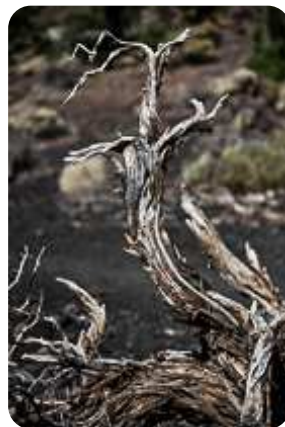
near Mirador de Samara - Teide NP