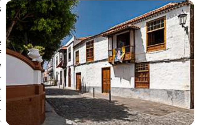
in Los Silos

So, back to the car and to Buenavista del Norte. The food is not really worth men-