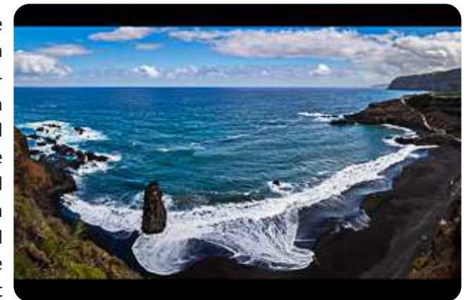
Playa El Bollullo - Puerto de la Cruz

In the evening I wanted to drive down to the city center, but as we're not sure where to go we change our mind and give the restaurant at the Tigaiga hotel a second chance. The hotel is close to ours, so we can walk and have a wine with our meal. The atmosphere on the terrace is nice anyway. This time the