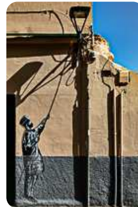
in Puerto de la Cruz