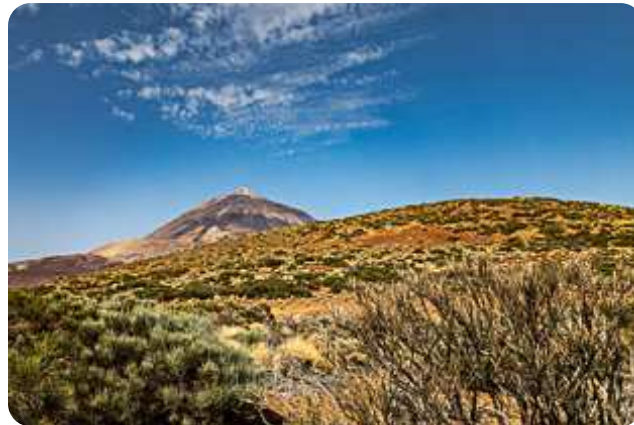
Arenas Negras - Teide NP

Today's hike starts in El Portillo, where the TF-24 leaves the TF-21. I park the car at the local visitor center, where there