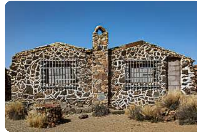
former sanatorium – Teide NP

this white and red caution tape, with no notice or other explanation. If I would go back to the base of this last hill there might be another access to the trail, but