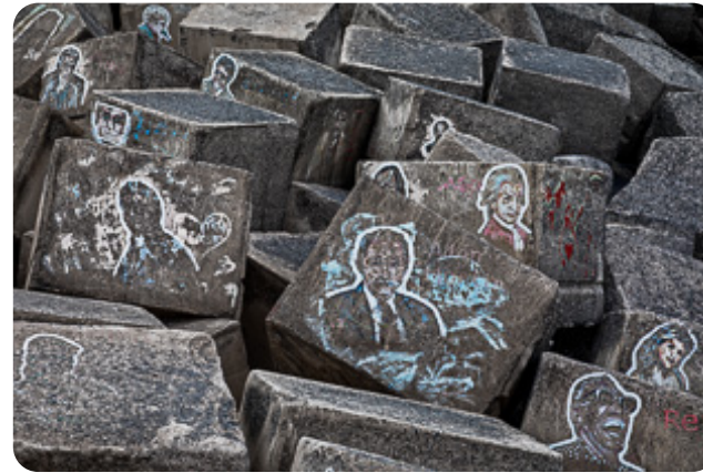
in Santa Cruz