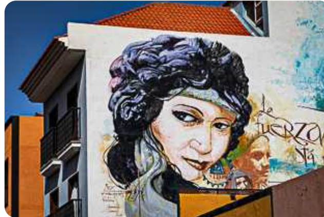
in Puerto de la Cruz

Now we have to walk up the streets to reach the base of Taoro garden and then to climb more than 300 steps. But it sounds worse than it is.