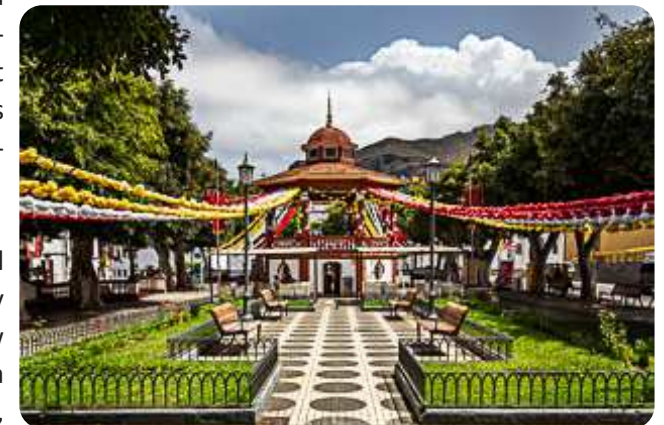
in Los Silos