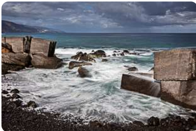
Explanada del Muelle - Puerto de la Cruz

Initially, I wanted to drive back on the TF-24 to show Freya another part of the park, but the clouds are still there and there wouldn't be much of a sight. But when we were at the first Mirador I thought to see the observatory. So we will drive there and hope for the best. At Portillo Alto the clouds are back. We turn onto TF-24 and the road slowly gains altitude. And indeed, just before we reach the viewpoints at the observatory, we come out of the fog.