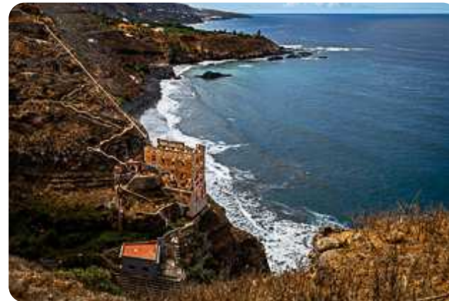
Casa Hamilton - Los Realejos