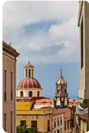
in La Orotava

Today's hike is a little lower than the previous ones. At this altitude, the Teide is covered with pine trees. The forest is not very dense and you can see many younger trees between the big ones. The way is a forest road and easy to walk. Unfortunately, it's open to cars as well and some locals with pick-ups are taking this opportunity today. Often two or three men are sitting inside with a couple of dogs in cages in the cargo area. Do they go hunting? I don't know, at least I don't hear any gunshots.