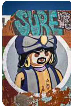
in Puerto de la Cruz