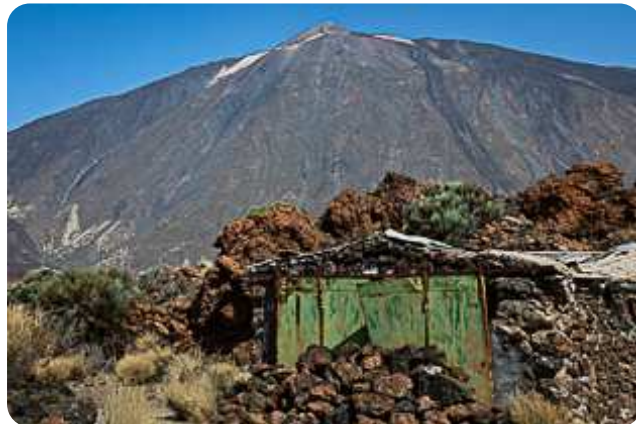
former sanatorium – Teide NP

and go parallel to the street back to the Parador. "Should" because the trail is closed. The closure is marked only with