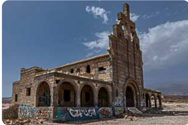
Sanatorio de Abona

on the highway, I can make out the convention center