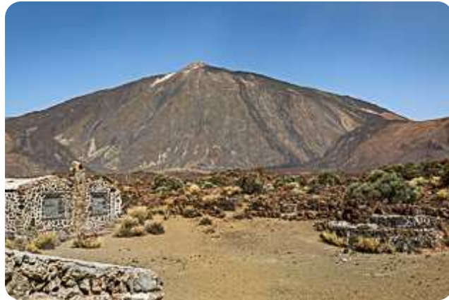
former sanatorium – Teide NP

nue my hike. After a while the path gains altitude and it becomes more strenuous, but still not bad. I'm now approaching the TF-21 where the trail should turn left