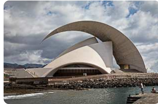
Auditorio de Tenerife - Santa Cruz

After wandering the streets for a while, I end the day and drive back to the hotel.